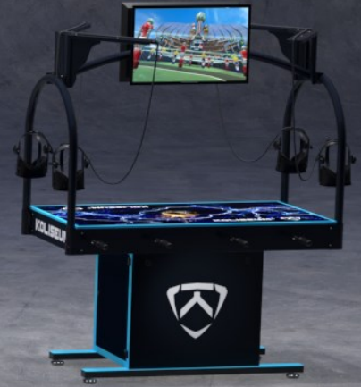
KOLISEUM Soccer VR™