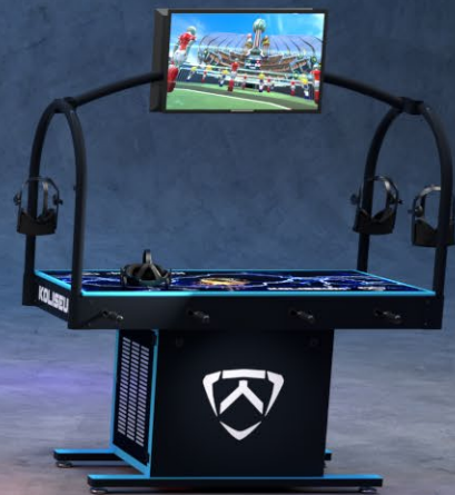
Koliseum Soccer VR™